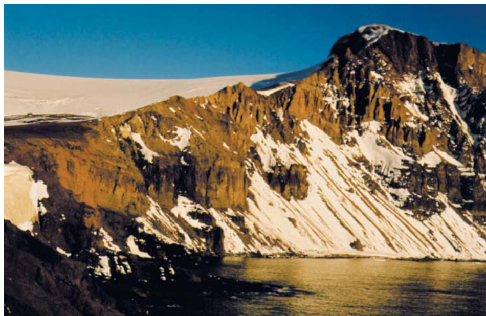
Fig. 4. Polonez Cove and Chopin Ridge as seen from Low Head. Prominent cliffs in the lower part of slope are formed by the Oligocene Polonez Cove Formation.

Pods and other invertebrates, as well as stromatolithic structures were made. Special attention was given to early-diagenetic processes. At Point Hennequin, late Oligocene interglacial fresh-water deposits of the Mount Wawel Formation revealed well preserved algal structures and meadow-ore horizons.