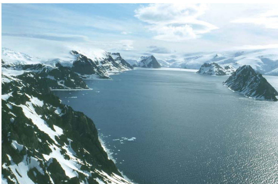
Fig. 1. View of Ezcurra Inlet and Dufayel Island from Panorama Ridge. Photograph by W. Majewski.

King George Island is located in the middle of the South Shetlands arc. It is heavily glaciated. Its bedrock consists of several tectonic blocks bounded by longitudinal faults. Island-arc extrusive and intrusive volcanics of Cretaceous to Miocene age dominate; however, fossiliferous Oligocene–Miocene glacio-marine and terrestrial deposits also occur (see Birkenmajer 2001, 2003; Gaździcki 1987, 1996). The island's spectacular and diverse coastal and submarine morphology (Fig. 1) resulted from glacial erosion mainly during the Pleistocene (Birkenmajer and Marsz 1999).