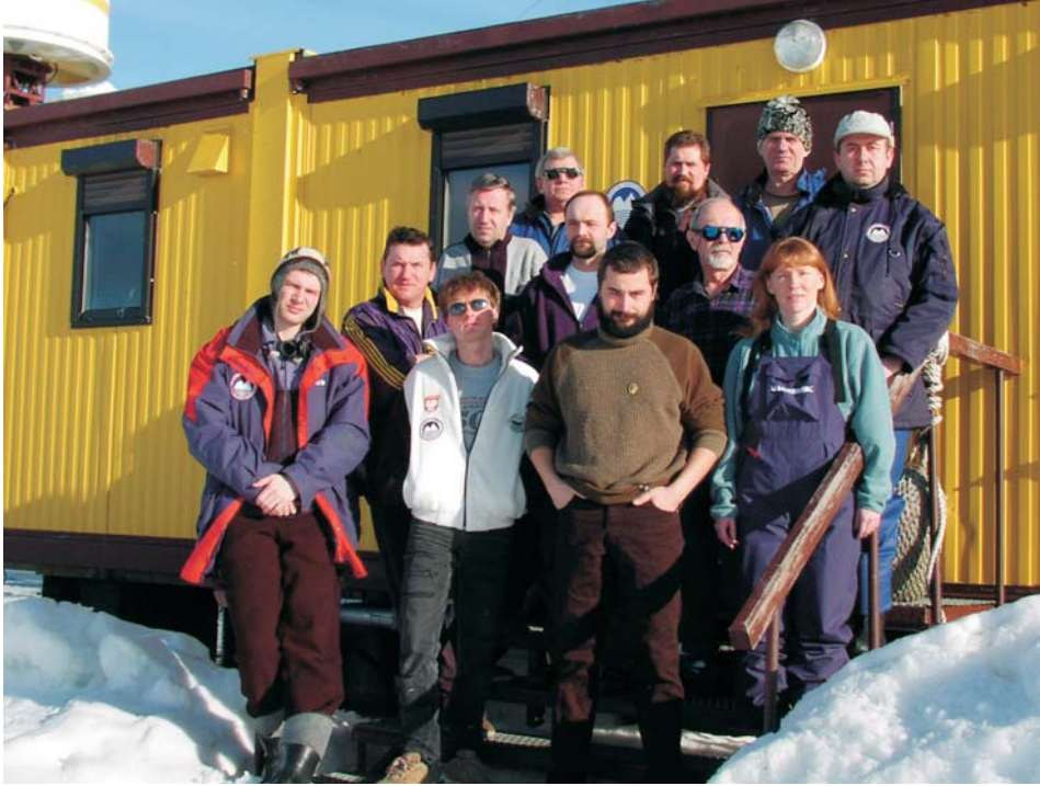
Fig. 3. Members of the wintering party.

Arctowski Cove. They brought onshore a total of 1879 tourists, who could enjoy Arctowski Station hospitality and the scenic beauty of its surroundings.